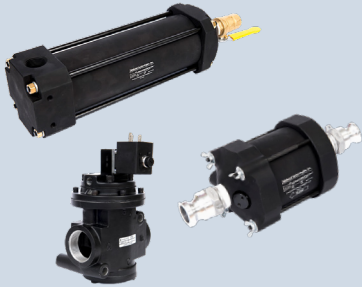
iFilters & Solenoid Valve